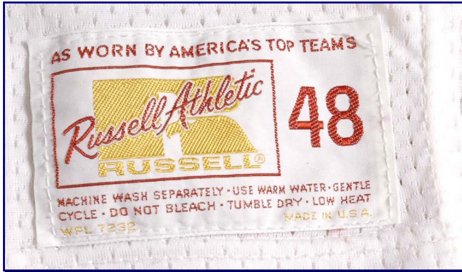
Figs. 82-8 & 82-9. Tagging (above) and sleeve (below) detail of circa 1982 Broncos road jersey