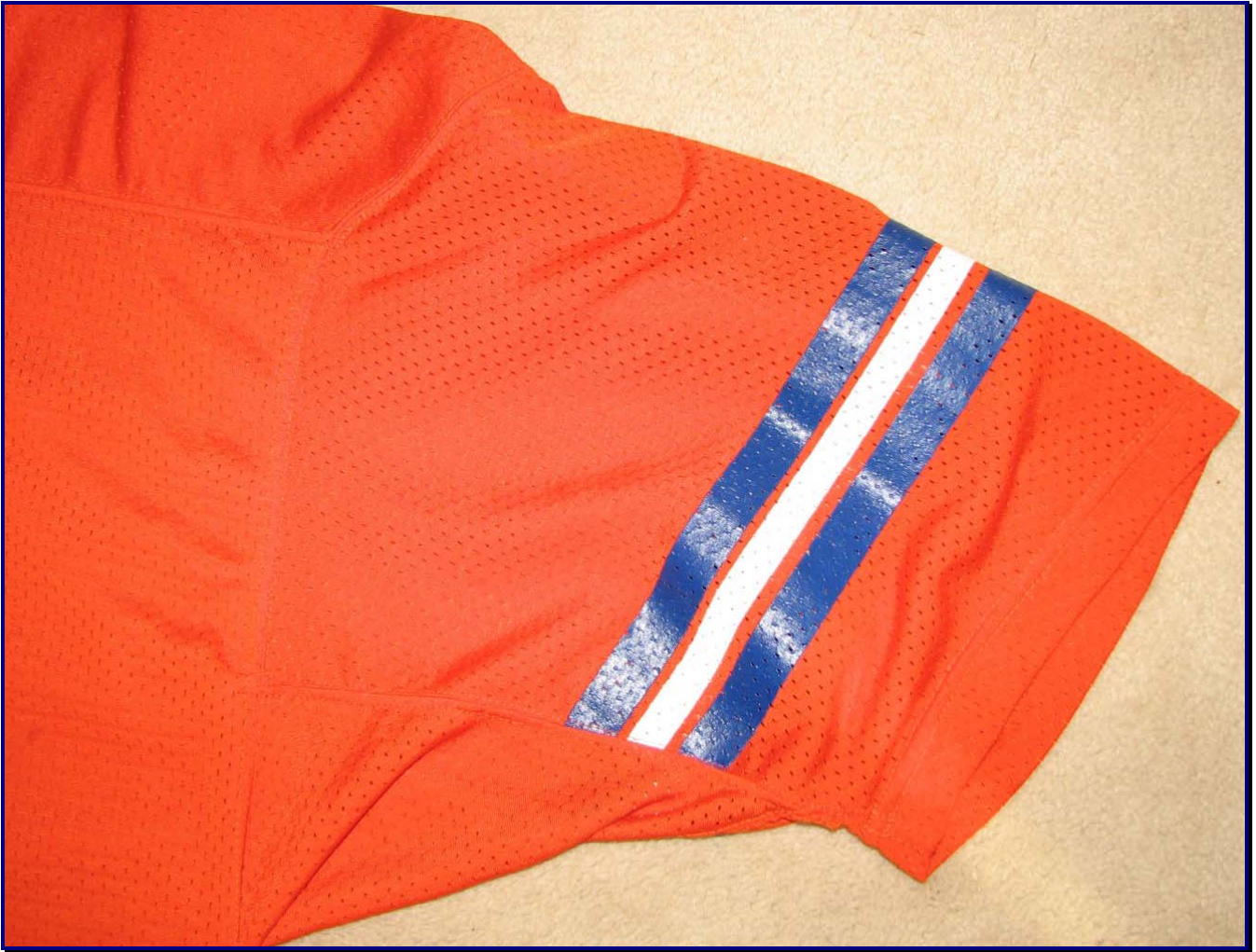
Fig. 82-6. Collar detail from circa 1982 home jersey