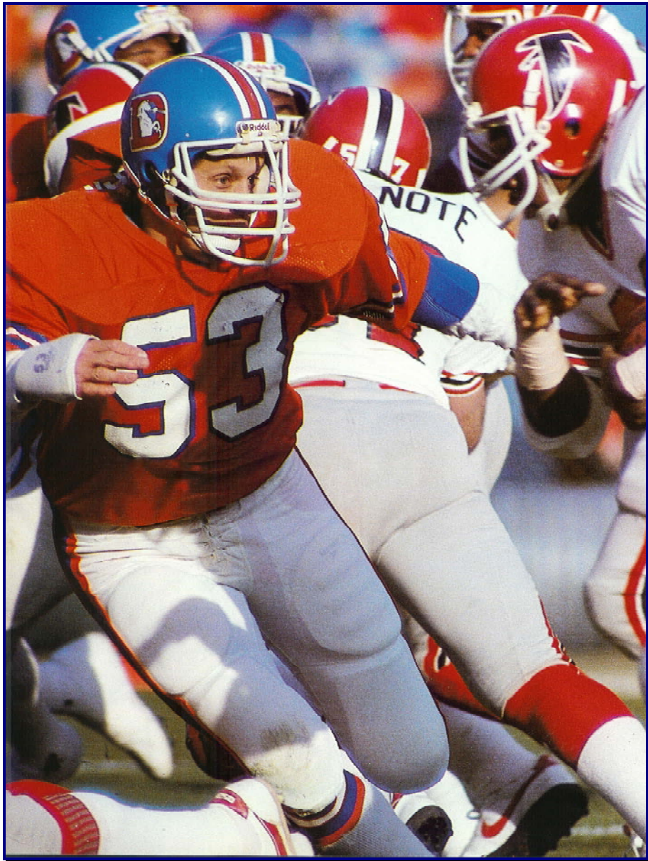
Fig. 82-1. 1982 Broncos home uniform (R. Gradishar, Dec 5)