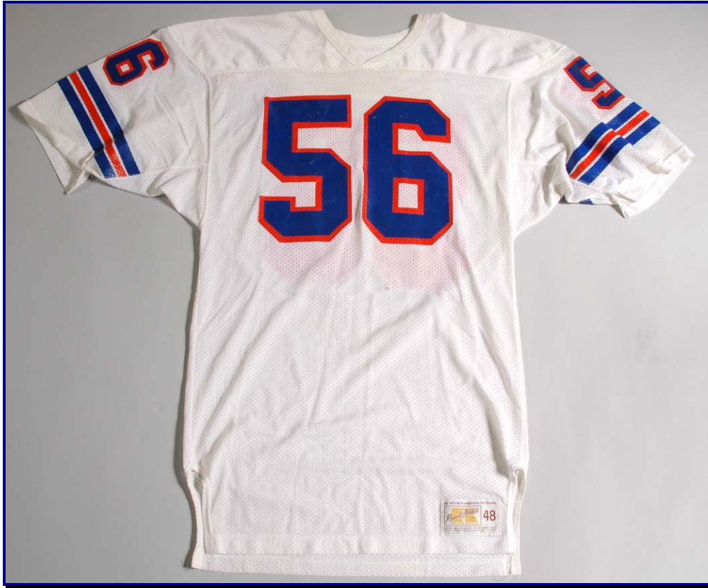
Figs. 82-6 & 82-7. Front (above) and rear (below) views of circa 1982 Broncos road jersey (L. Evans)