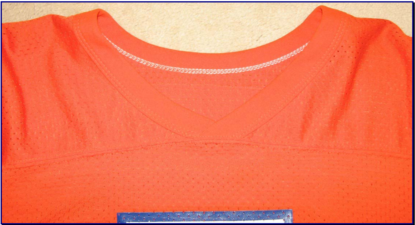
Fig. 82-6. Collar detail from circa 1982 home jersey