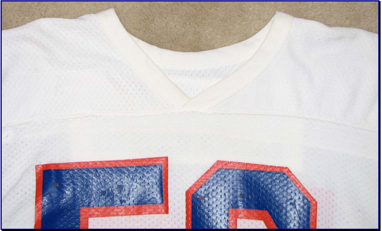
Figs. 82-10 & 82-11. Collar (above) and nameplate (below) detail of circa 1982 Broncos road jersey