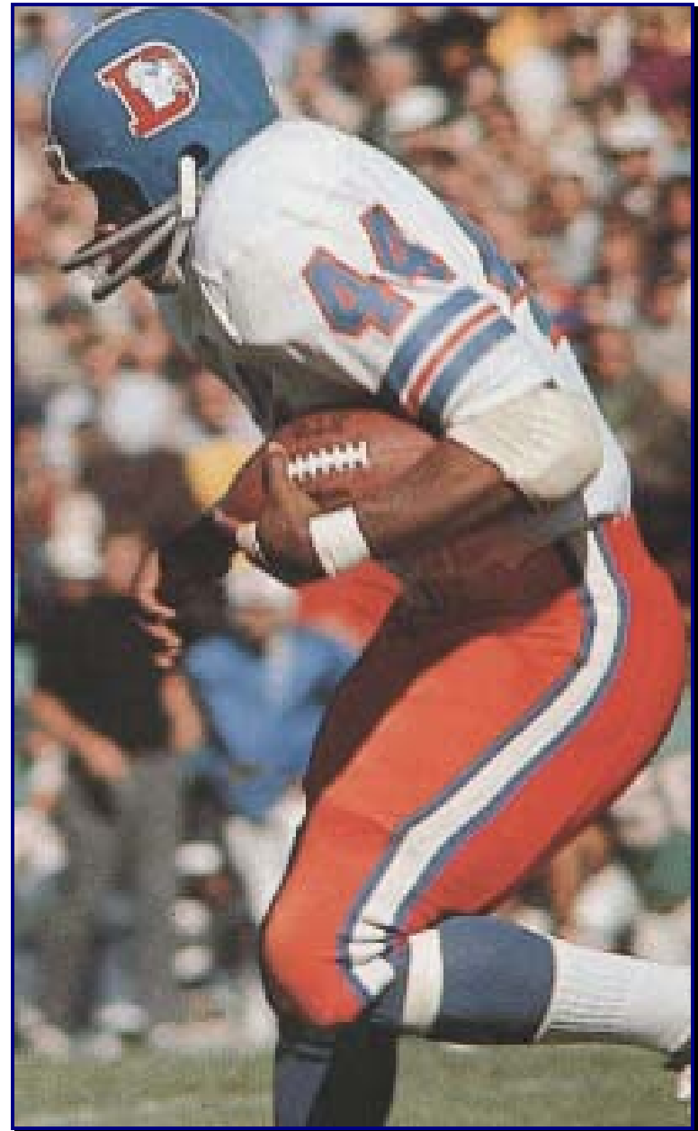
Fig. 71-2. 1971 road uniform