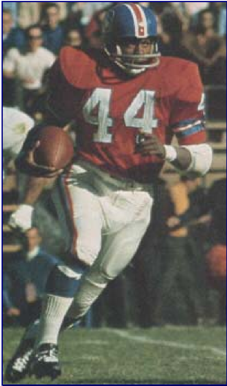
Fig. 71-1. 1971 home uniform